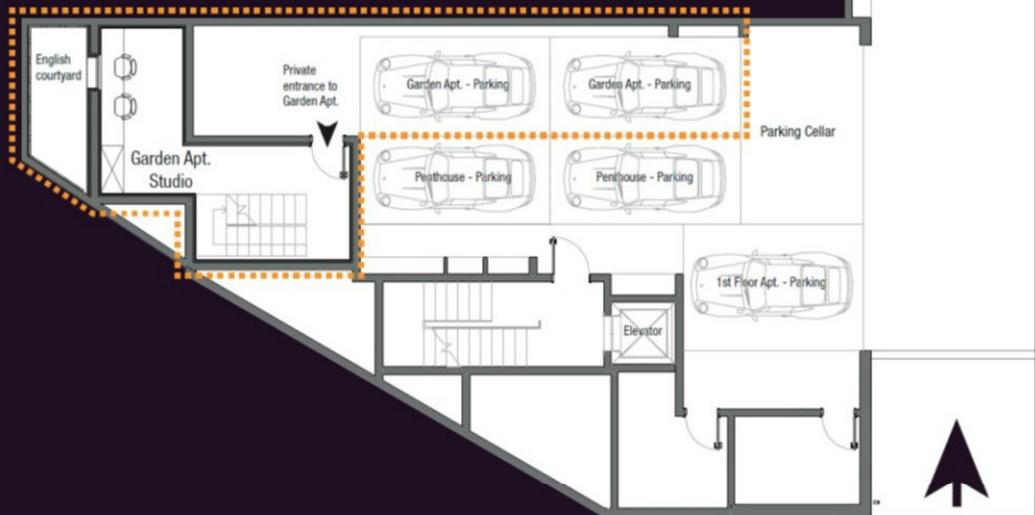
Garden Apt. / Studio & Parking Plans